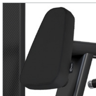
Static chest pad