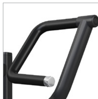
Angled triple-grip handles