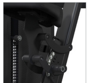
Seat and lever / manual adjustments