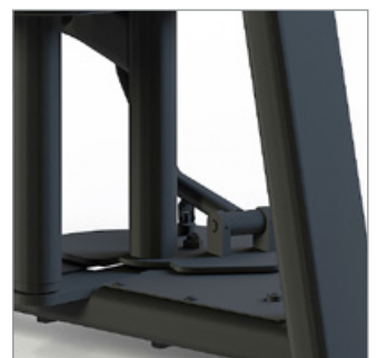
Seat and lever / manual adjustments