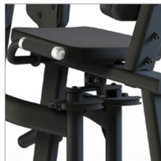
Variable resistance cams