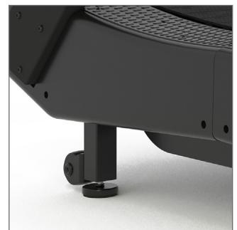
Transportation wheels for easy manoeuvrability.

Actual product specifications may differ due to manufacturing requirements. Pulse Fitness reserves the right to make changes to its products and services, where it considers necessary.