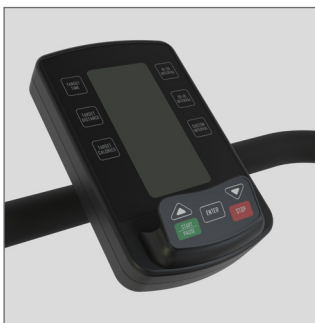
Comprehensive console programmes.